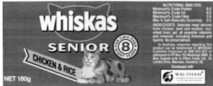
Figure 1: A Whiskas cat food label.

Whiskas cat food, shown above, is manufactured by Uncle Ben's. Uncle Ben's want to produce their cat food products as cheaply as possible while ensuring they meet the stated nutritional analysis requirements shown on the cans. Thus they want to vary the quantities of each ingredient used (the main ingredients being chicken, beef, mutton, rice, wheat and gel) while still meeting their nutritional standards.